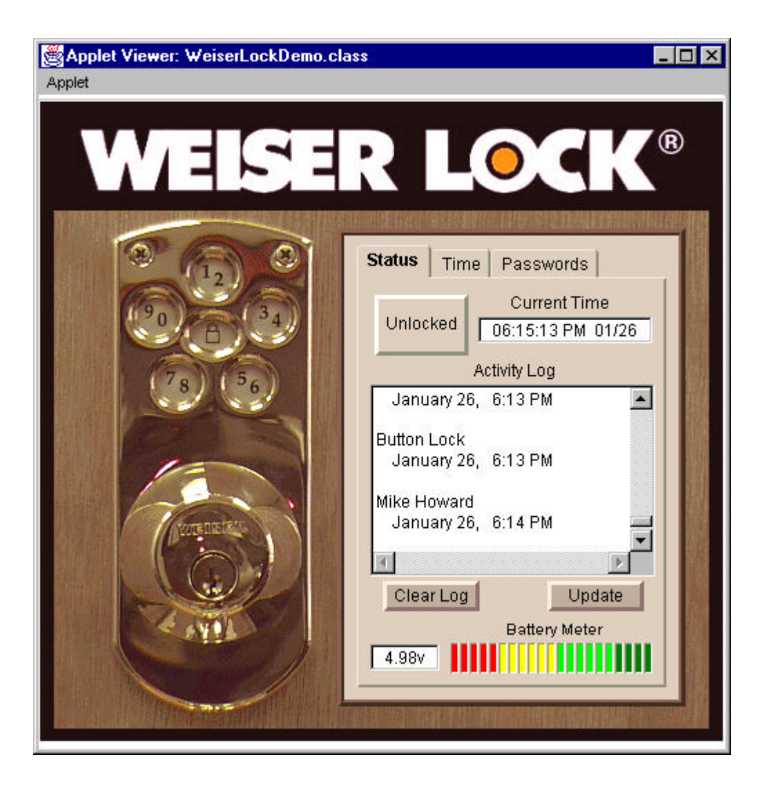
Figure 1 – Weiser Lock Interface